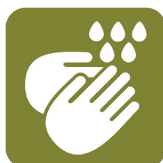
Wash Hands Well, Often