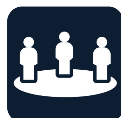
Avoid Crowded Areas