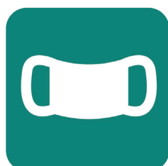
Use a Face Covering